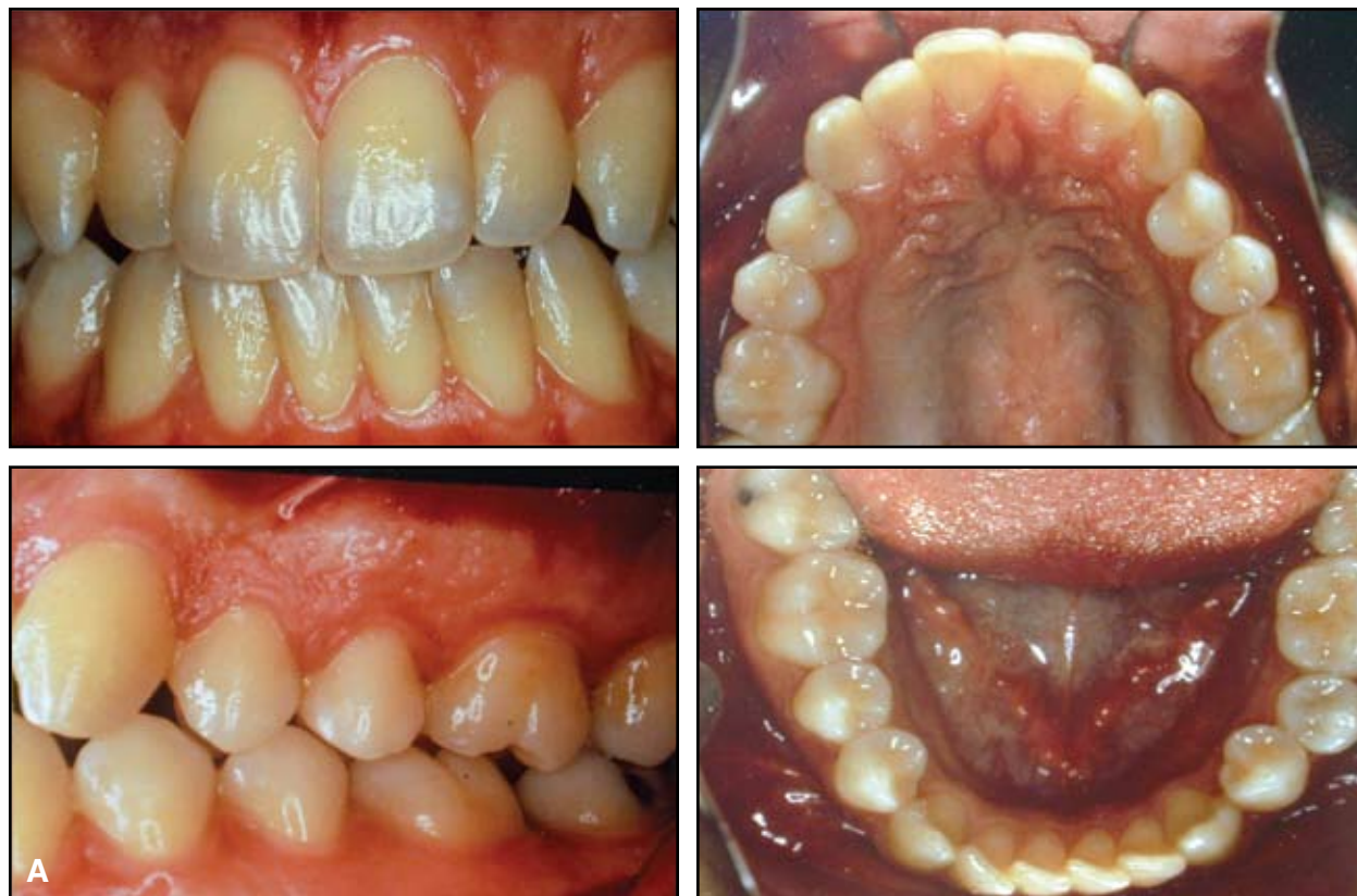
Fig. 1 A. Patient with minimal overbite and overjet, tendency toward Class III molar relationship, minimal upper crowding, and moderate lower crowding (continued on next page).

DR. CHUDASAMA How does ARS fit into the extraction-nonextraction debate?