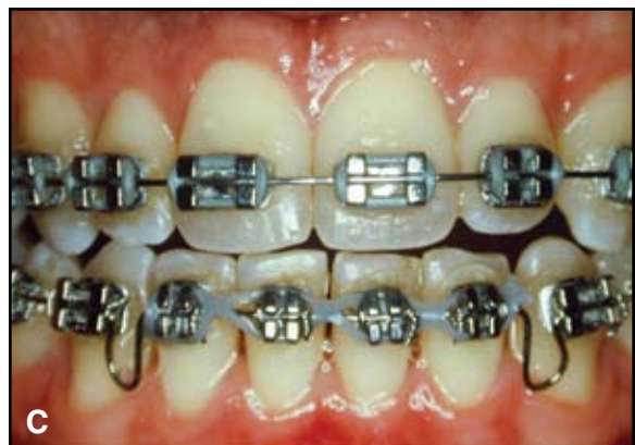
Fig. 1 (cont.) B. Initial ARS sites in lower arch (arrows); separators placed to gain space for additional ARS. C. Appraising archform after leveling, alignment, and space management. Because lower incisors need to be retracted distally and upper incisors placed over them to establish optimum overbite and overjet, anterior ARS is also indicated (continued on next page).